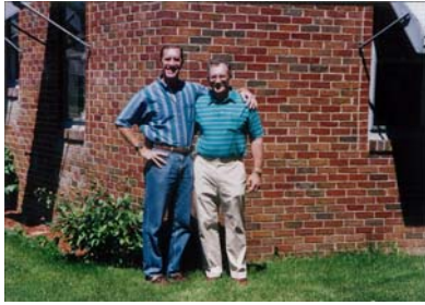
PAULEY FINANCIAL SERVICES, INC.